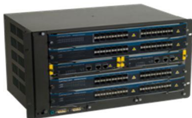
OptiCore 400 Chassis